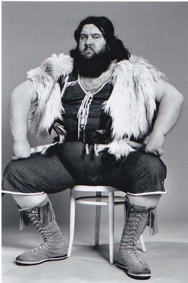
Big Daddy and Giant Haystacks