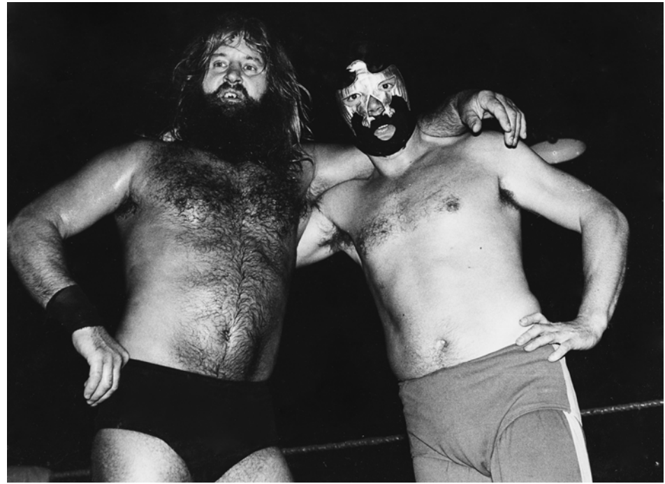
Above Adrian Street with his father Right